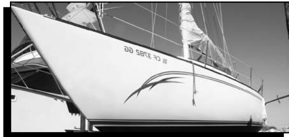
33' RANGER – 1978 Fresh Bottom Paint & Reduced! LP Topside and Hull + Graphics NOW ONLY -- $24,500!!!