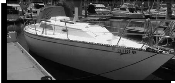
30' RANGER – 1978 New on Market - MUST SELL Wheel, Autopilot, Tabernacled OFFERS NEEDED - $12,500