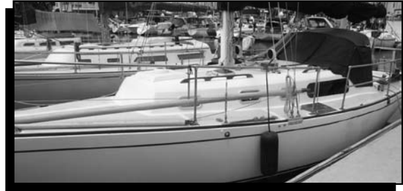
33' MORGAN – 1969 Incredible buy in a blue cruiser Spacious Interior & Cockpit Check the specs - $17,500