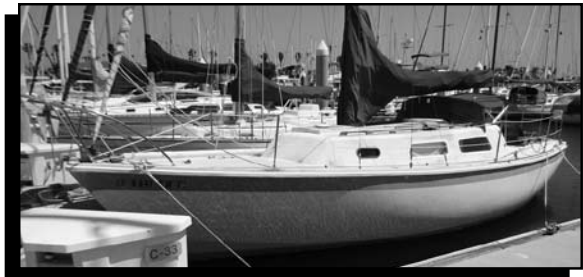
29' CAL 2-29 1974 New on Market and Ready! Diesel Aux, CAL Sailing Special Can't Miss this one - $18,000