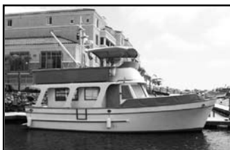
37' C&L Europa Sedan Trawler Twin Ford Lehman Diesel, Dual Steering, Radar, Autopilot, Furuno GPS, Two Staterooms, New Canvas, Refrigeration 08, Avon Dinghy w/ob, A Rare Europa Style Trawler in Excellent Condition!!! Asking $99,995