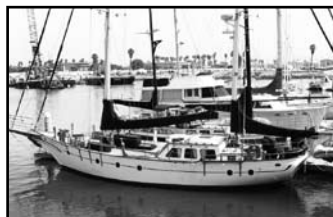
50' Hudson Force Pilothouse 1983 William Garden Design, Full Keel, Three Staterooms, Ford Lehman Diesel, Dual Steering, Autopilot, Radar, 10' Avon Rib w/8Hp Ob, Asking $136,900