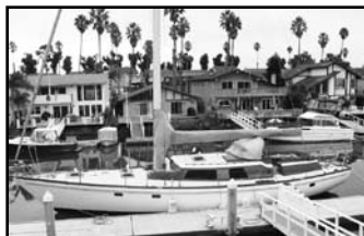
60' Ted Hood/ Frans Maas Centerboard Sloop Twin Diesels, 7.5kw Genset, Inverter, Chartplotter, Autopilot, Furling Jib, Dodger, Three Staterooms, Well Maintained, Recent Haul-Out. Asking $249,000