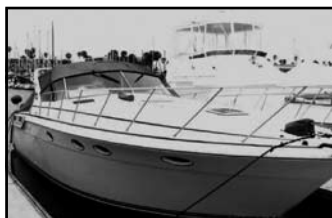
43' Wellcraft Portafino Express 1991 Twin Volvo Diesels, Genset, Radar, GPS, Autopilot, Refrigeration, Hard Bottom Dinghy w/ob, Excellent Condition, Asking $89,900