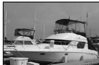
35' Silverton Convertable 2001 Twin Mercruisers, Low Hrs, Genset, Chart Plotter, Radar, Flybridge Enclosure, Beautiful Condition, At Our Docks, Asking...$109,000.00