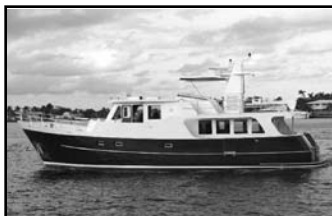
57' Real Ships Pilothouse Trawler 2002 Caterpillar Diesel, 16KW Genset, Bow Thruster, Stabilizers, Steel Hull, Updated Electronics, Stunning Interior, Three Staterooms, Serious Long Range Cruiser, Located Poulsbo WA. Asking $999,000

www.yachtworld.com/charlotteschmidt • Csyachtsales@cs.com