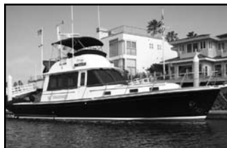
43' Grand Banks Eastbay Flybridge 2001 Cat Diesel, Full Simrad Electronics, Bow Thruster, Electronic Engine Controls, Trolling Valves, Inverter, Watermaker, Hyd Swim Platform, Rib w/30hp Honda, Two Staterooms, Reverse Cycle A/C Vessel Shows Pride Of Ownership, Excellent Condition, Asking $395,000