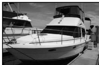
42' Cooper Prowler 1989 Twin Detroit Diesels Low/Hrs, Onan 8KW Genset, Inverter/Converter/Battery charger, Radar, GPS Map, Autopilot, Full Galley/Dinette, Achilles Dinghy W/15hp Yamaha, Beautiful interior, Asking $128,000