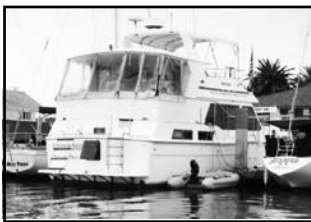
40' Ponderosa 1985 Twin Diesel, 2 Staterooms/ 2 Heads. Only $85,000