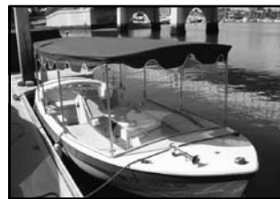
18' Duffy Classic 1995 $7,000