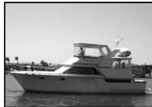
1988 48' Californian CPMY Perfect Condition - Twin Cats - Hard Top - Comes with transferable 50' Mooring in Newport Harbor. Price Reduced! $197,000