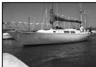
1971 41' Newport New Engine - New Rigging Great Sailing! $39,900