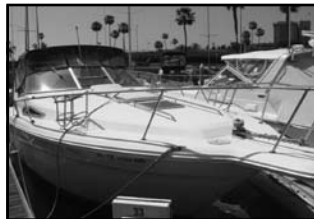
31' Sea Ray Sundancer 1990 Large Interior, fresh water cooled. Only $29,000