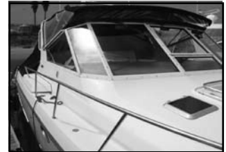
1997 Tiara Express Twin Gas - Low Hours - Lots of Goodies! $99,500