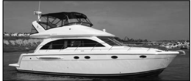
41' Meridian Sedan Bridge 2007 Thrusters, A/C, Diesel, QSB motors, 200 hours. Like new. Has all the bells & whistles. $329,000