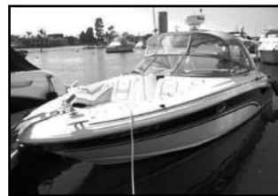
2002 29' Sea Ray Bow Rider Low hours - Twin engines - Looks like new! $49,000