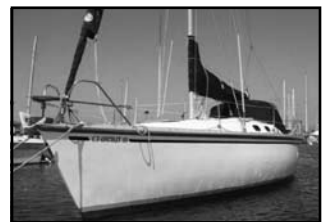
35' 1988 Hunter Legend $41,900