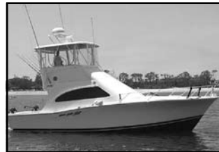
1998 36' Luhrs Clean with Twin Yanmars Full electronics - slip may be transferable In Newport Beach