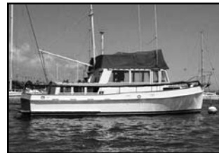
36' 1971 Grand Banks $29,900