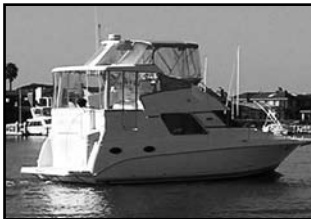
1999 35' Silverton Absolutely a stunning boat New everything in and out Only $110,000